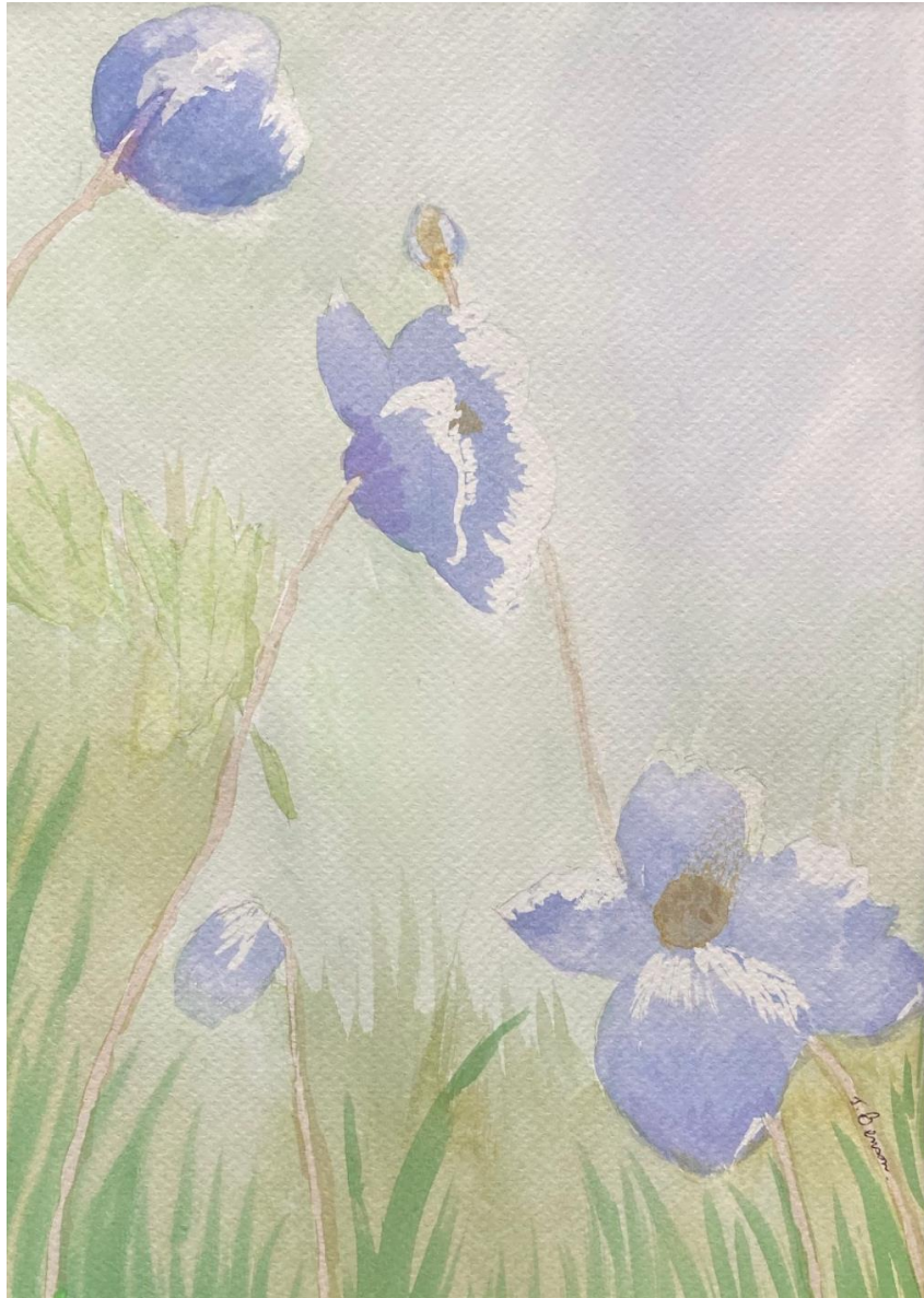
Art Work by Judith Benson (East Yorkshire)